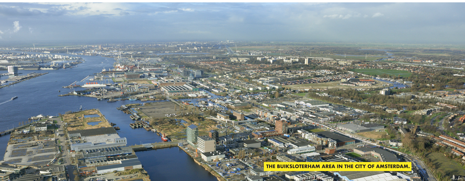
THE BUIKSLOTERHAM AREA IN THE CITY OF AMSTERDAM.