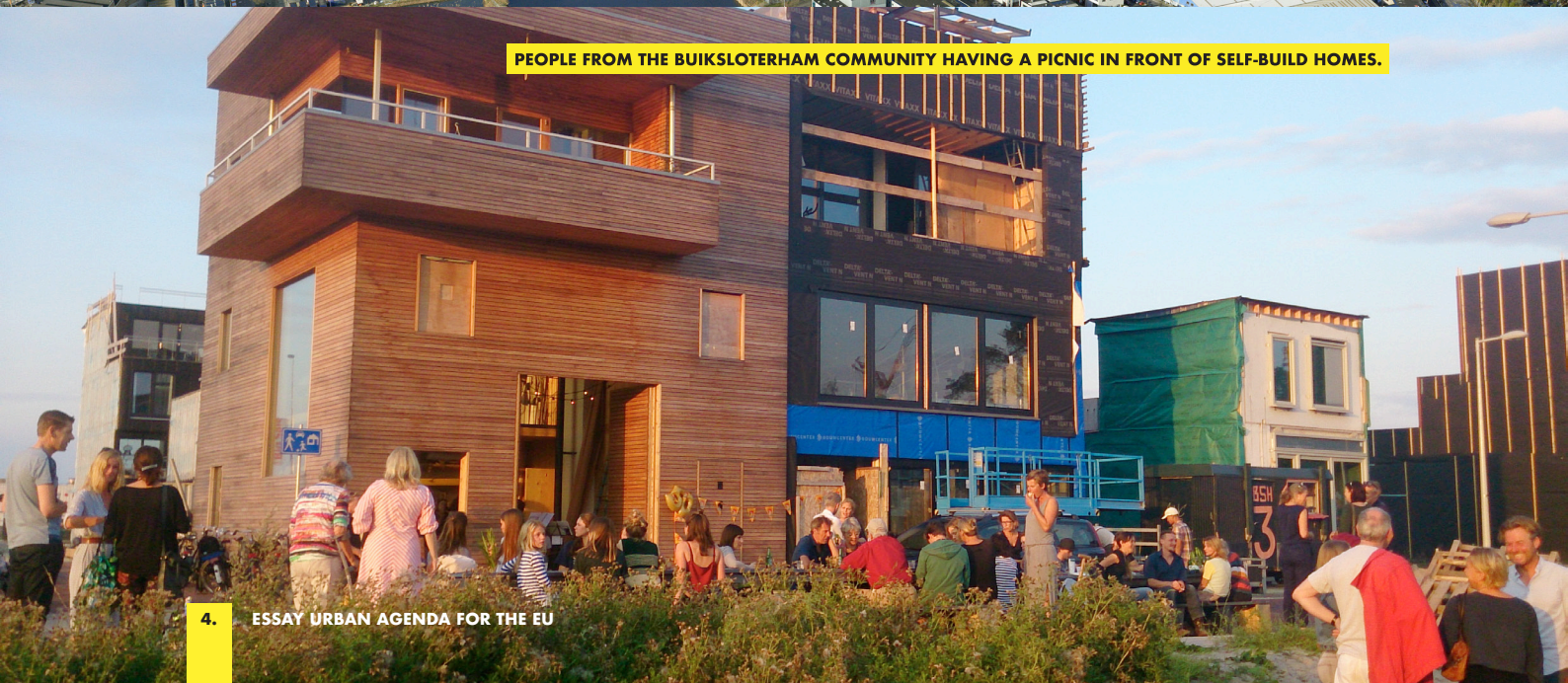
PEOPLE FROM THE BUIKSLOTERHAM COMMUNITY HAVING A PICNIC IN FRONT OF SELF-BUILD HOMES.